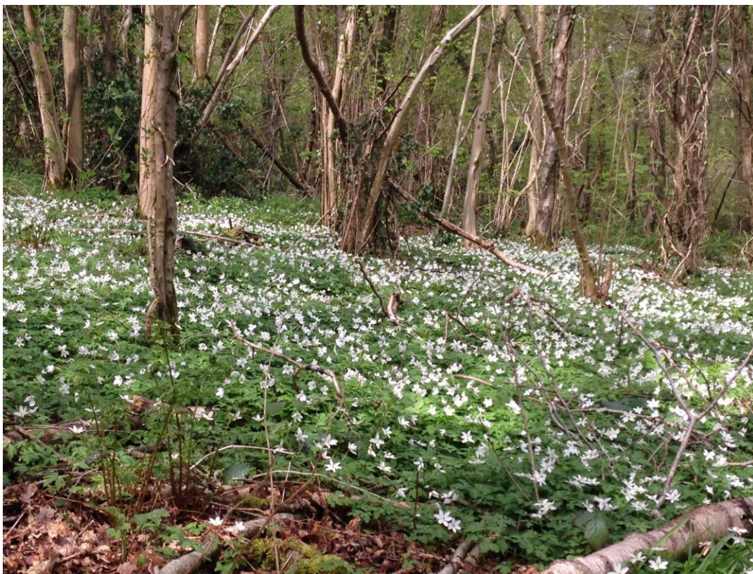
Pantymwyn Woods