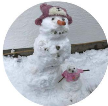
Some of the snow men/sculpture Competition entries in December